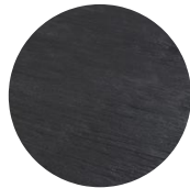
HFTS teak scuro