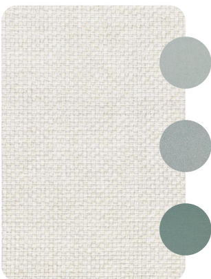
SD SALTY WHITE 2