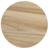
HFTB teak brushed